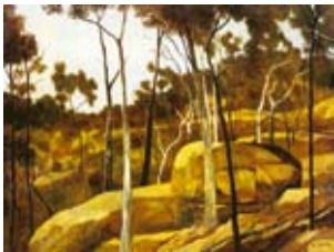
Ray Crooke, Laura landscape, c1989 oil, acrylic on linen

A Cairns Regional Gallery Curated Exhibition